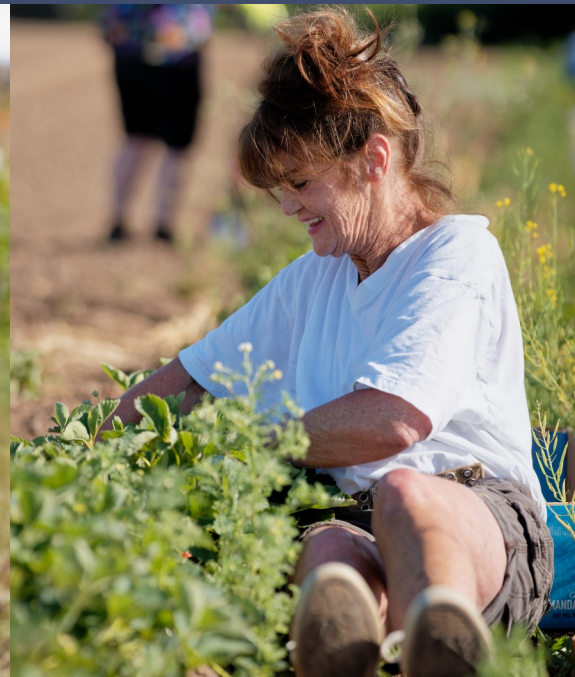
Gleaners at Blueberry Meadows, Grampa's Farm, and the OSU Crop Farm